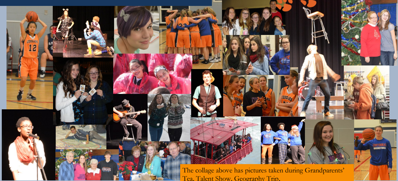
The collage above has pictures taken during Grandparents' Tea, Talent Show, Geography Trip, Girls' Basketball & Grade 8 Open House .