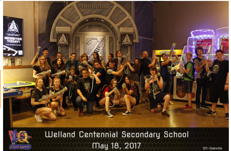
Welland Centennial Secondary School May 18, 2017

Grade 10 Science students had the electromagnetic spectrum and applications of light and optics brought to life on their field trip to play laser tag at Laser Quest in Oakville.