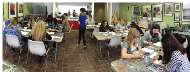
At the Art Gallery of Hamilton

The Arts Special High Skills Major students attended the Art Gallery of Hamilton in May showcasing Italian Baroque and Canadian Contemporary art. Students also participated in a visual arts experience with gallery artists.