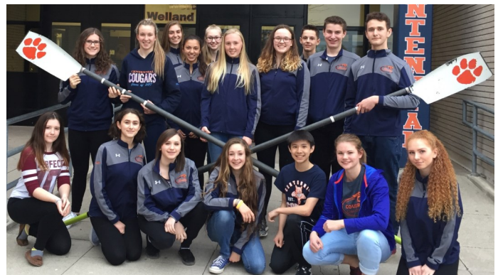
2017 WCSS Rowing Team

Our swim and rowing teams are becoming increasingly popular with Cougar Athletes. This year we have 27 students on the swim team and 47 have signed up for the rowing team. Good luck to the teams in the coming season.